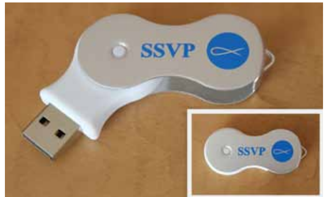
SSVP USB Flash Drive 2.0 - 8GB - $10.00