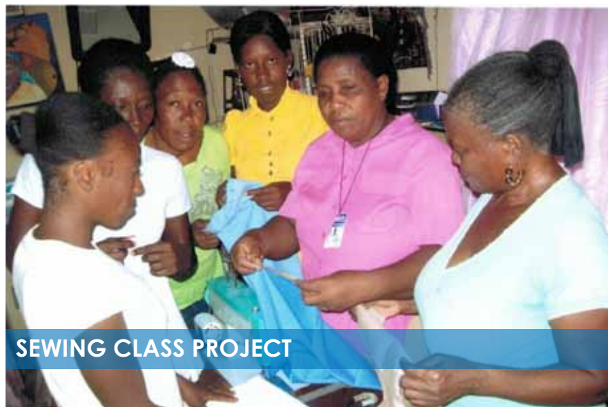
SEWING CLASS PROJECT