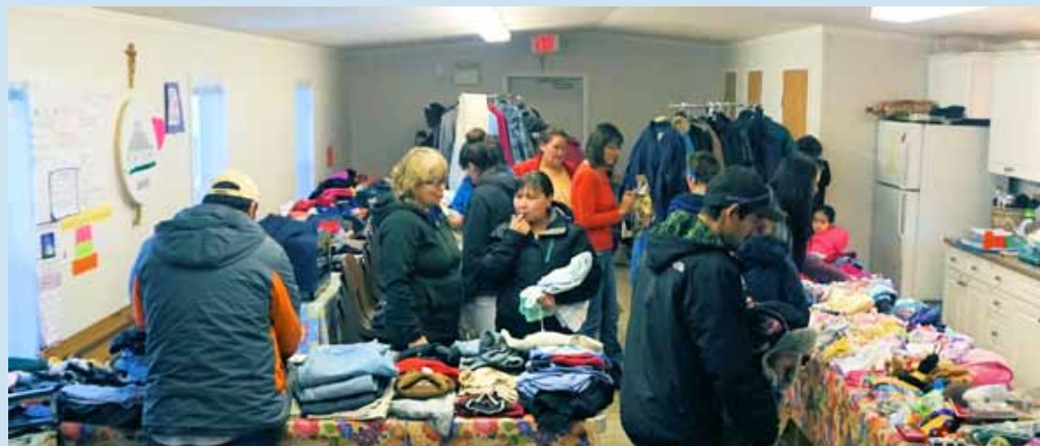
CLOTHING FROM THE SEA CONTAINER BEING DISTRIBUTED IN INUVIK NT