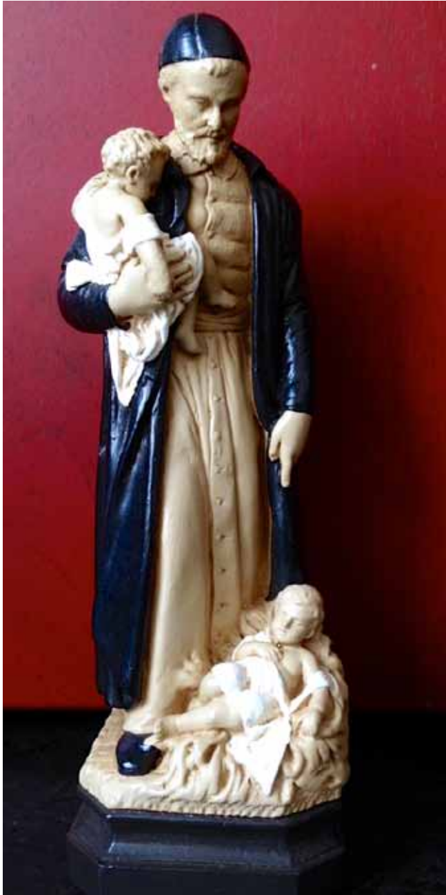
Statue of Saint Vincent de Paul from BACCI SARL (France)

Decor wood tone; approximate height of 20 cm. Those statues made of HYDRACAL acrylic resin, a material that looks like plaster, but is much more resistant, like a resin.