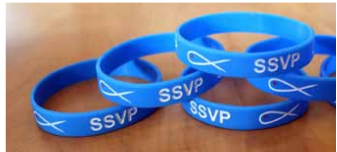
SSVP bracelets - $1.00

See our online catalogue for more information or to order any articles. Visit our website at: www.ssvp.ca .