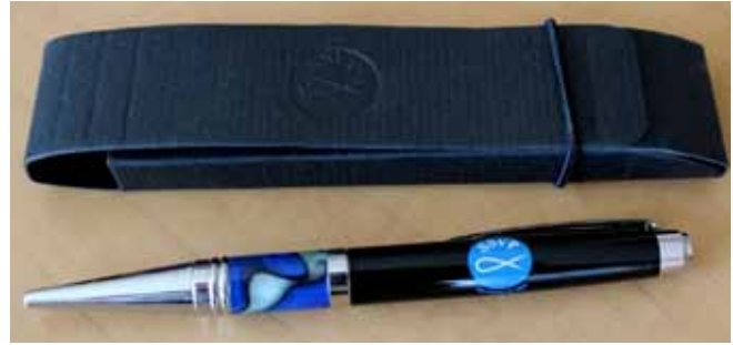
SSVP pen with cardboard gift box. - $17.50

Decor wood tone; approximate height of 20 cm. Those statues made of HYDRACAL acrylic resin, a material that looks like plaster, but is much more resistant, like a resin.