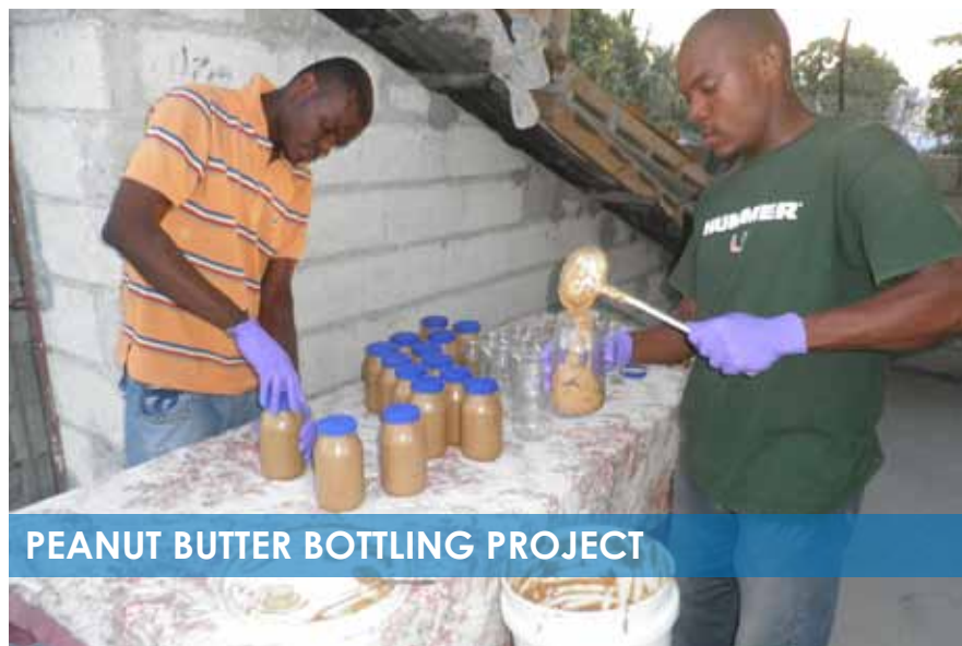
PEANUT BUTTER BOTTLING PROJECT